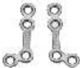
L Plate Oblique Angle Short

Part No. N 103000004 Right N 104000004 Left