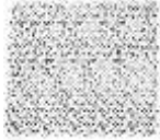
Mesh 0.6 mm