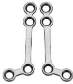
L Oblique Long Leg Large

Part No. Right N 21000004 Left N 21100006