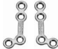
L Oblique Short Leg Medium