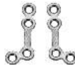
L Oblique Short Leg Small

Part No. N 200000004 Right N 201000004 Left