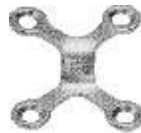
Chin Plate - 0.8mm

Part No. Height N 218000004 5mm N 219000004 7mm N 220000004 9mm N 221000004 10mm