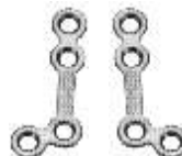
L Oblique Short Leg Medium

Part No. N 200000004 Right N 201000004 Left