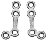
L Oblique Short Leg Small

MAXILLOFACIAL 0.8MM SET Implants having plate thickness of 0.8mm 2.0mm dia screw to be used.