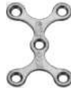
X Plate - 5 Hole