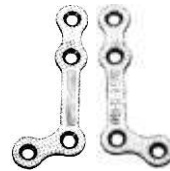
L Oblique Long Leg Medium