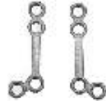
L Plate Oblique Angle Short

Maxillofacial 0.6mm Set Implants having plate thickness of 0.6mm 1.5,, dia screw to be used.