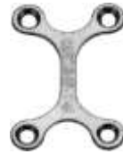
Double Y Plate - Broad