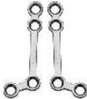
L Oblique Long Leg Large