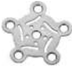
Burr Hole Cover 0.4mm