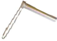
Sleeve 18x15mm Part No. A 729001000