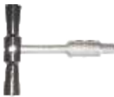
T Handle Part No. A 945001000