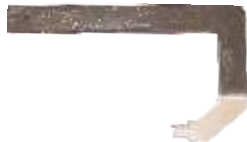
Yt nail Jig