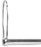
Sleeve 18 x 15 mm