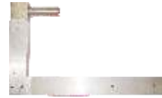
Sol-T PFD Jig