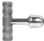
T Handle Part No. A 945001000